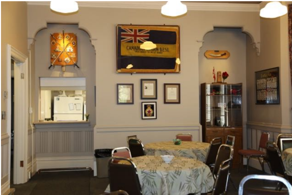
Main Hall at 514 Government