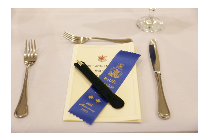
Place setting at 80th Anniversary Banquet